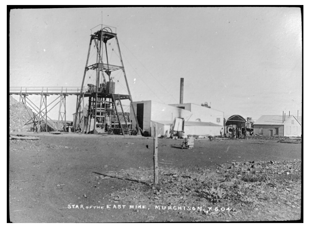
Figure 2 Star of The East

The Project lies only 2.2km from Star Minerals' existing Tumblegum South gold project which has an existing Inferred Resource estimate which totals 600kt, at a grade of 2.2 g/t Au.