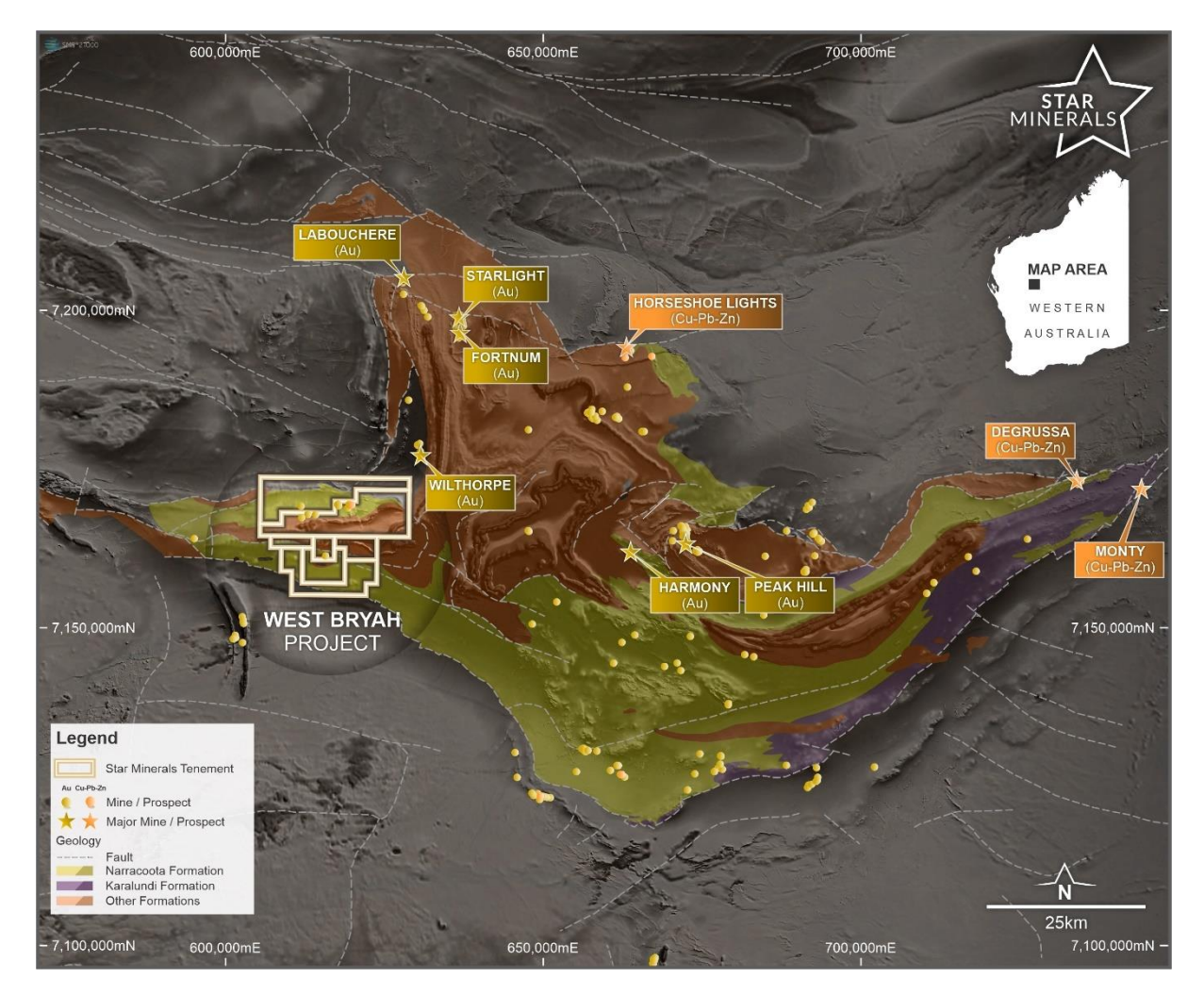
Figure 3 - West Bryah Project