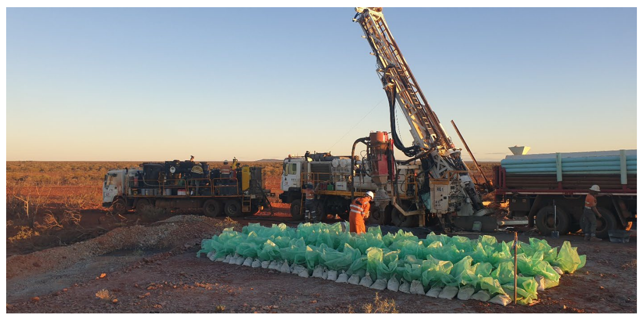
Figure 2 - Phase 2 Drilling at Tumblegum South

The next stages of drilling were two separate programs.